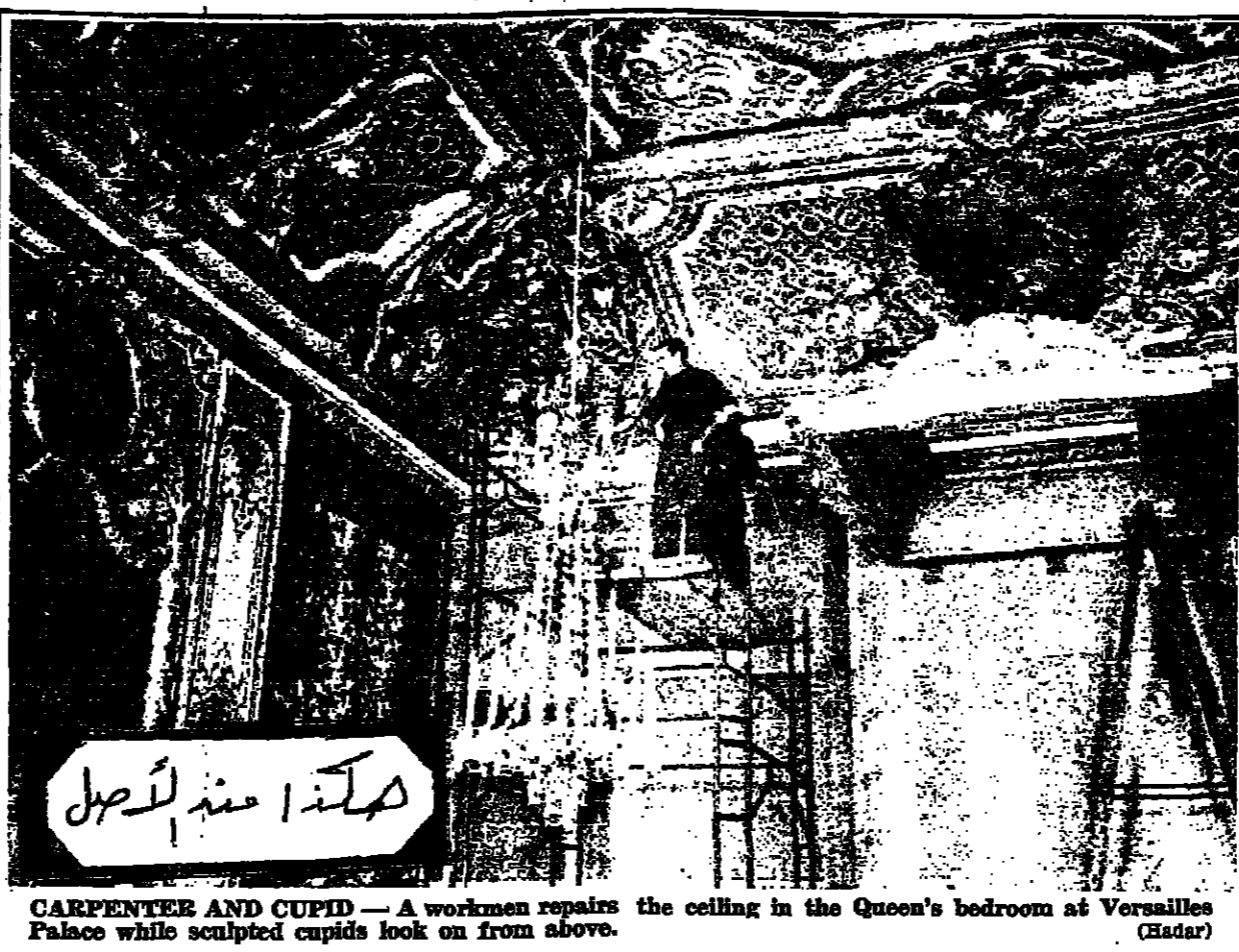
CARPENTER AND CUPID — A workman repairs the ceiling in the Queen's bedroom at Versailles Palace while sculpted cupids look on from above.

Premier Andreotti is giving high priority to the law and order issue — which means in the current Italian political context extremist violence by left- and right-wing extra-parliamentary groups. He has announced stiffer laws against arms hoarding and trafficking, greater powers of arrest for police, speedier trial procedure, and a general reform of the Italian penal code — which dates back to Fascist times. In recent months there have been signs of a revival of political terrorism in Italy with the unexplained killing of Giampaolo Pansa, the extreme left-wing millionaire publisher; the murder in